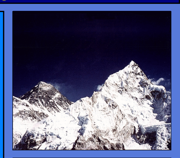
More challenging than the mountains on the planet Mars...