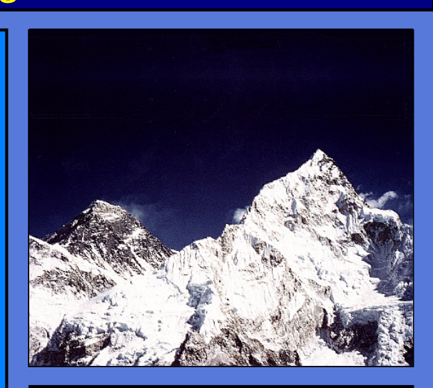
More challenging than the mountains on the planet Mars...